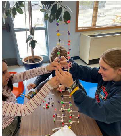
SUBMITTED BY TIM VERBOOMEN

During the STEM rotational class just before Easter, our middle school students had some fun competing in teams to build the tallest towers or longest bridges they could. Their building materials were a bag of jelly beans and a box of round toothpicks! Students worked through the engineering design process as they planned, tested, iterated, and built their towers and bridges. Students have gained a deeper appreciation for the engineering design process during the STEM Rotational class, a class that meets several times a week to learn about, and tackle challenges related to STEM (Science, Technology, Engineering, and Math).